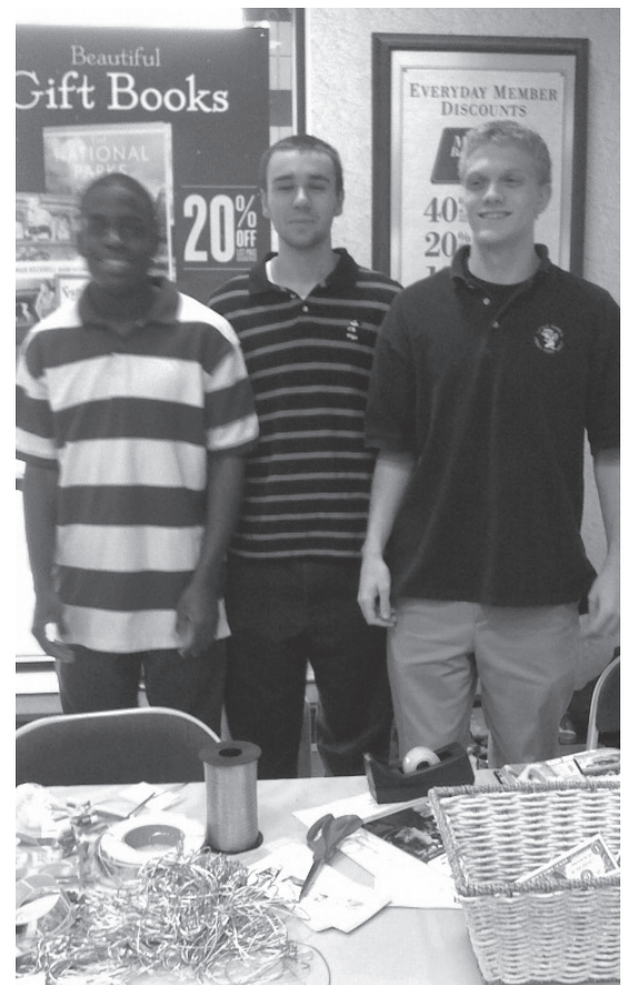
Students from Mystic Valley Charter School wrapped gifts at the Barnes & Noble Saugus during the holidays and donated the proceeds to RESPOND.